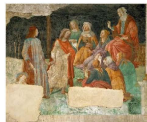
Young Man Being Introduced to the Seven Liberal Arts, by Sandro Botticelli

This course is offered only to Australian-based participants with a 30-person attendance cap, so register early. Proceeds for this conference go directly to help ACES.